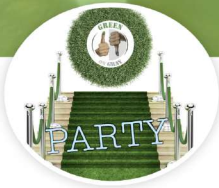
GREEN CARPET PARTY

We propose a celebration with three unique options with an unforgettable message of environmental awareness.