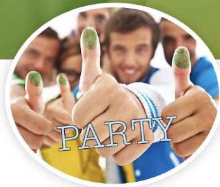
LEAVE YOUR GREEN MARK FOR THE PLANET