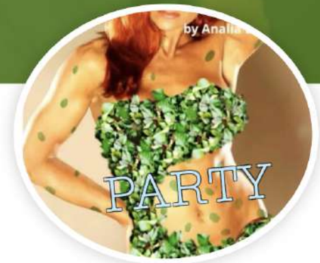
YOU LEAVE YOUR GREEN MARK ON ME